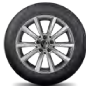
"Merano", 18-inch Adamantium Dark Metallic

Further accessories for your wheels, including valve caps, wheel bolt locking sets, tyre bag sets and snow chains, can be found in the universal accessories section on page 49.