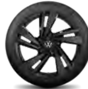
"Nevada", 20-inch Black