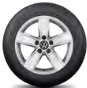
"Corvara", 17-inch Brilliant Silver