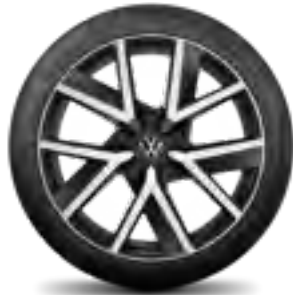
"Braga", 20-inch Dark Graphite Matt