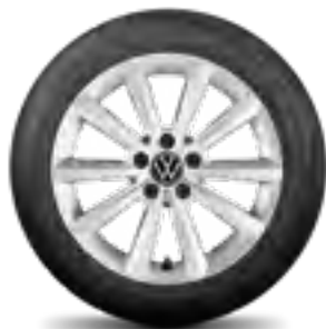
"Merano", 18-inch Brilliant Silver