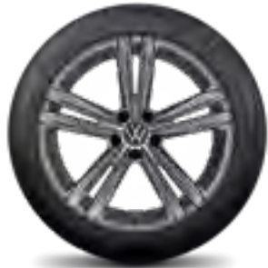
"Sebring", 19-inch Grey Metallic