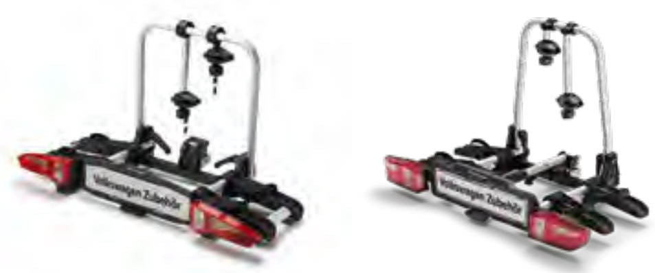
Bicycle carriers for the towing bracket

The standardised ex works FIX4BIKE connection can be used to attach your Volkswagen bicycle carrier for the towing bracket. This does not increase the payload.