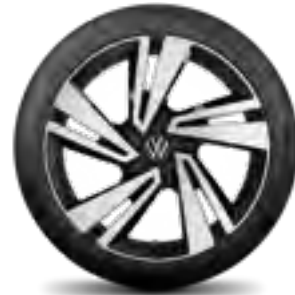
"Nevada", 20-inch Black, diamond-turned