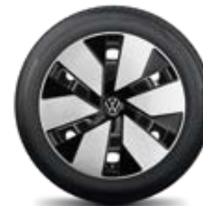
"Bicolour design", 18-inch