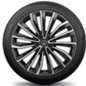
"Seoul", 20-inch Dark Graphite Metallic

Further accessories for your wheels, including valve caps, wheel bolt locking sets, tyre bag sets and snow chains, can be found in the universal accessories section on page 51.