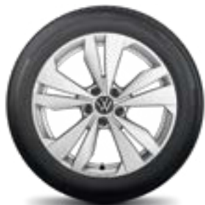
"Loen", 18, 19-inch Brilliant Silver