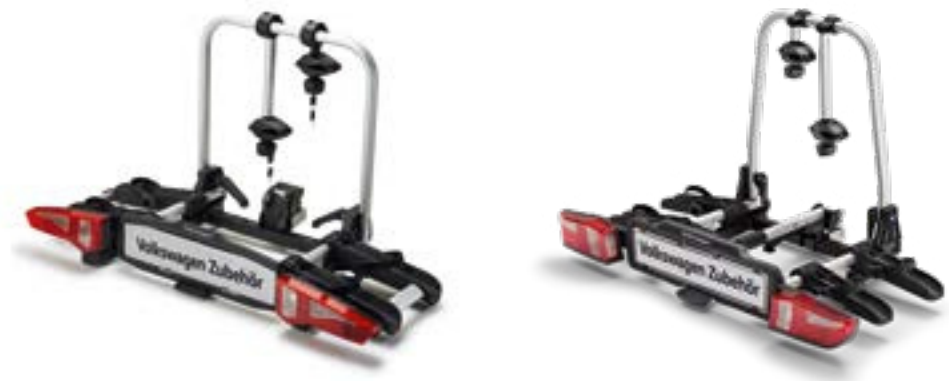
Bicycle carriers for the towing bracket

The standardised ex works FIX4BIKE connection can be used to attach your Volkswagen bicycle carrier for the towing bracket. This does not increase the payload.