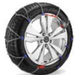
Snow chains for the ID.3

The requirements of the current ABE (German type approval) or of current certification must be complied with. Please use the standard-fit wheel bolts provided. Please ensure that the load index (LI) of the selected tyres is not lower than the LI specified in the vehicle documents or CoC papers. All winter alloy wheels are treated with an especially resistant coating to ensure that they are suitable for use in winter.