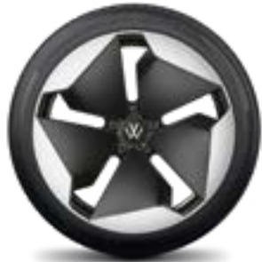
"Sanya", 20-inch Black, diamond-turned