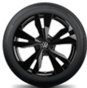
"Loen", 19-inch Black, gloss