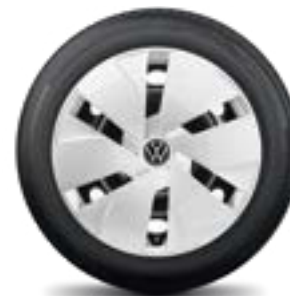
"Silver design", 18-inch